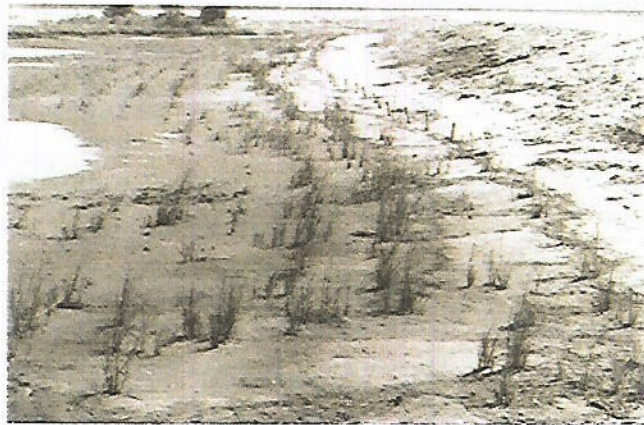
FIGURE 3. Archie Creek marsh site, August 1978.