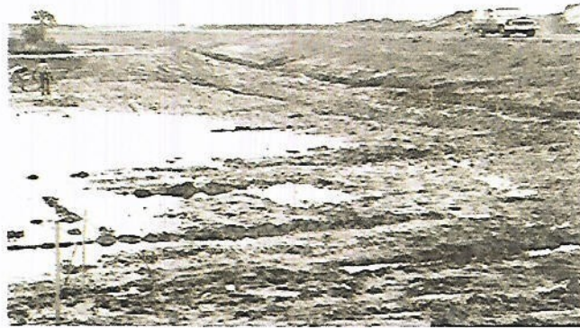
FIGURE 2. View of a 1.8 ha marsh creation site along Archie Creek, Tampa, Fla., April 1978.