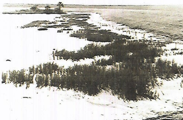
FIGURE 4. Archie Creek marsh site, April 1979.