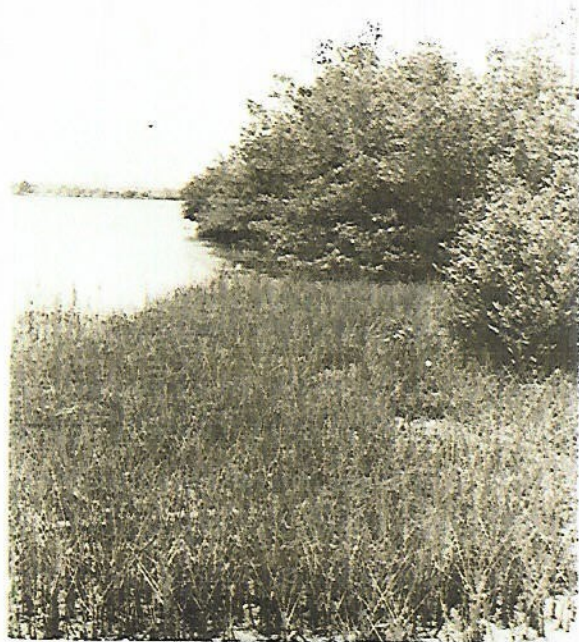
FIGURE 1. Typical view of a stand of smooth cordgrass ( Spartina alterniflora Loisel.) situated in the lower intertidal zone in front of black mangroves ( Avicennia germinans (L.) L. Tampa Bay, Fla.

comments on a similar shading out of S. anglica : "It was found that Spartina retained dominance for about 20 years, but in the subsequent 12 years, about 50 percent of the Spartina had been replaced by the invading species..." These invading species came in along the landward edge of the marsh and included Agropyron pungens , Scirpus maritimus , and Phragmites communis .