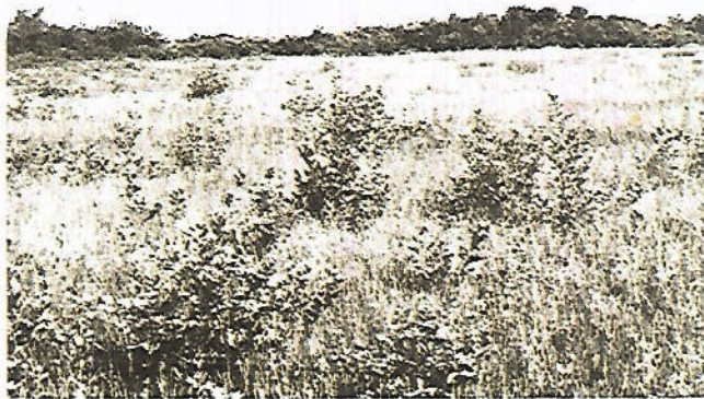
FIGURE 7. Ground level view of a dredged material island in Tampa Bay, Fla.