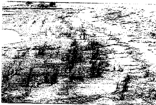
FIGURE 3. Archie Creek marsh site, August 1978.