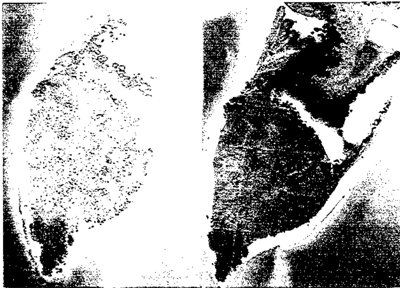
FIGURE 5. Vertical aerial photographs of a dredged material island in Tampa Bay, Fla.