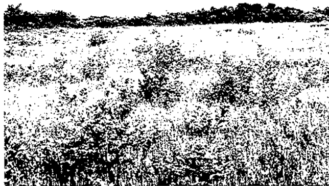
FIGURE 7. Ground level view of a dredged material island in Tampa Bay, Fla.