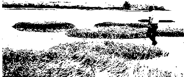
FIGURE 6. Ground level view of a dredged material island in Tampa Bay, Fla.