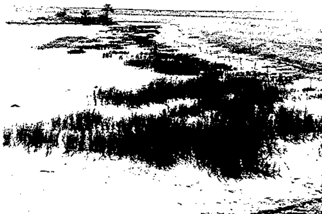
FIGURE 4. Archie Creek marsh site, April 1979.